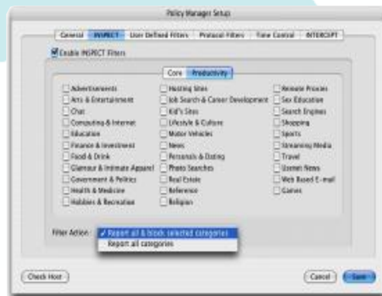
InterGate Inspect Productivity Categories