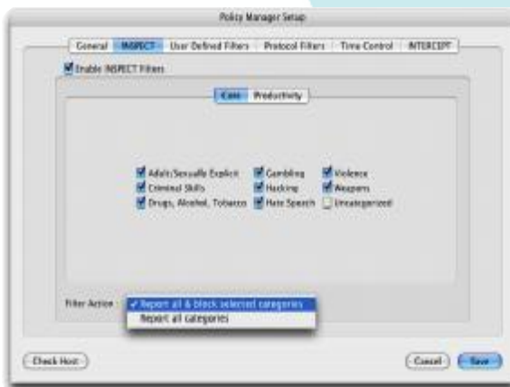
InterGate Inspect Core Categories